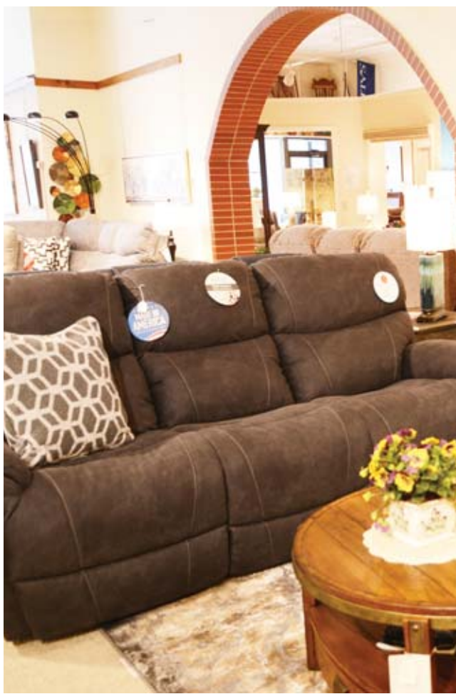
A sofa sits in front of the beautiful arch that separates the two show room areas of the lower floor of the historic Christ Furniture building.

Stop in and check out the beautiful showroom, sit a spell and let Jim and his staff show you all the wonders of the new age of furniture.