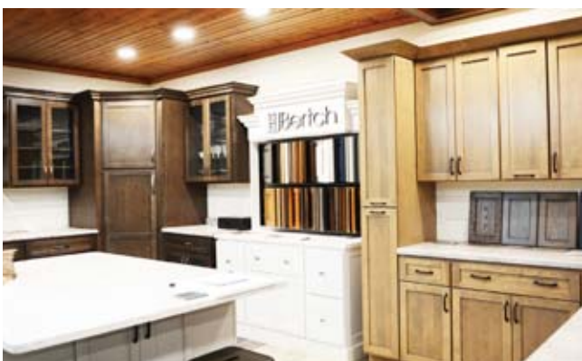
Community Lumber carries Bertch and KraftMaid Cabinetry. Bertch cabinets are made in Iowa.