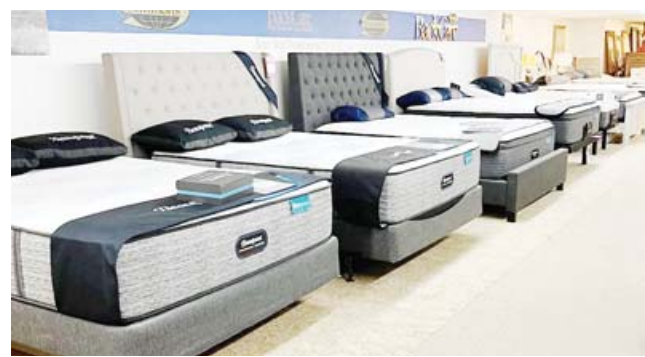
A row of beds waits to be tried out in the basement of Christ Furniture.