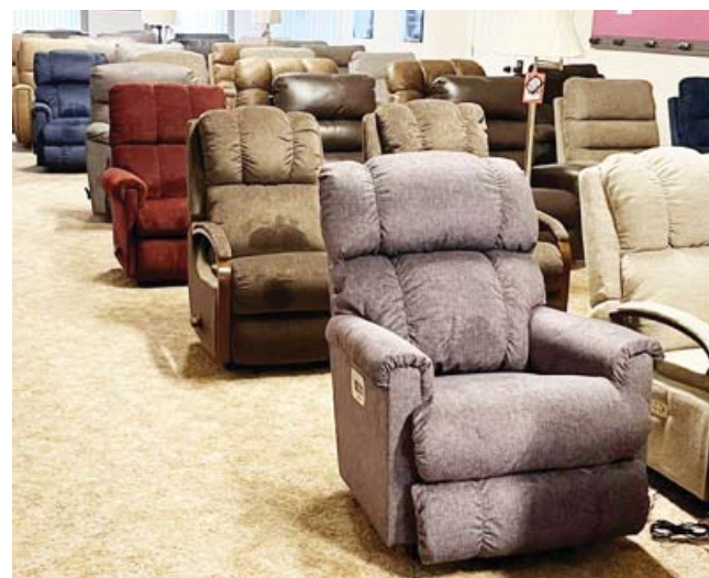
Christ Furniture carries over 80 recliners in stock to suit any ones needs.