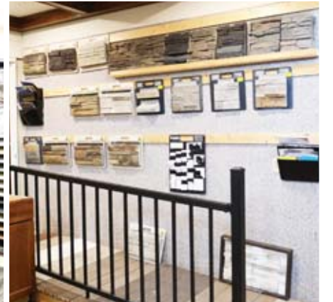
Community Lumber makes smart use of the space inside the store, such as this wall of siding options, in order to offer the many products they carry.