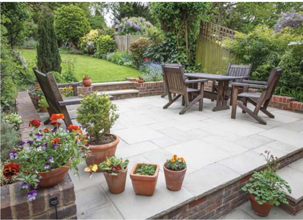
Outdoor living spaces are one popular hardscaping trend that figures to remain sought-after for years to come.

Hardscaping isn't a new trend, but it has been trending in recent years. Hardscaping is an umbrella term that includes everything from outdoor living rooms to incorporating natural stone into a landscape. Outdoor living rooms are one hardscaping trend that has become increasingly popular of late. These spaces serve as an extension of indoor living spaces. The home improvement experts at HGTV note that recently homeowners have looked to create covered outdoor rooms that can be enjoyed more frequently than patios or decks that are not protected from the elements.