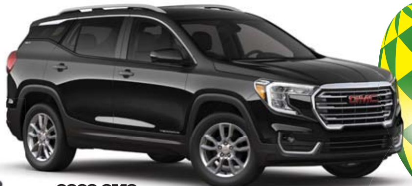
2023 GMC TERRAIN