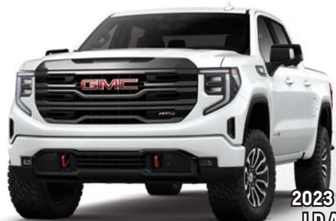
2023 GMC LD AT4