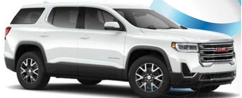
2023 GMC ACADIA DENALI