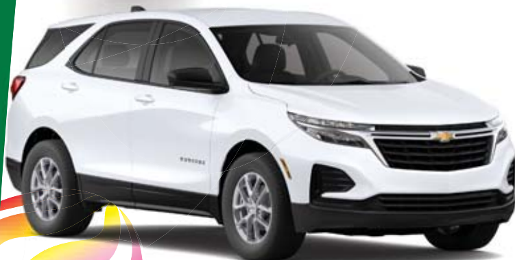
2023 CHEVY EQUINOX

GMC ACADIA & TERRAIN'S AVAILABLE. GMC LD TRUCKS AT4, DENALI, SLT'S 5.3 GAS, 6.2 GAS AND DIESEL'S IN STOCK. GMC HD SLT DIESEL.