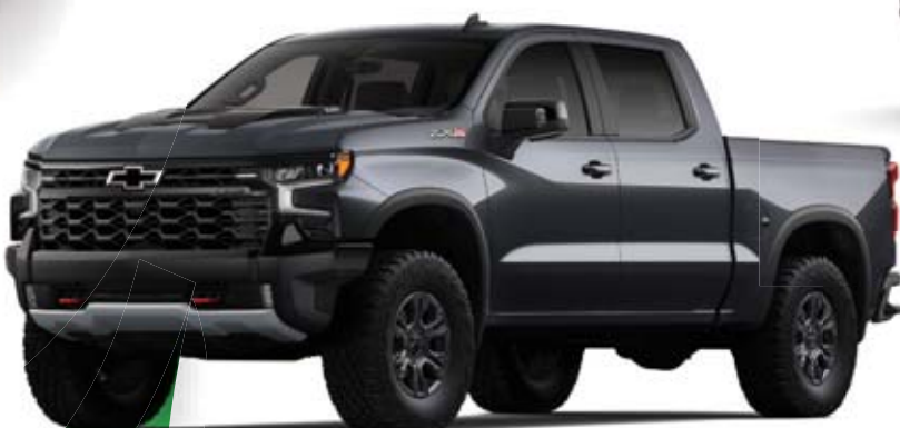
2023 CHEVY LD ZR2